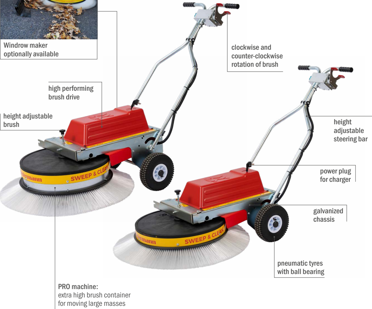
high performing brush drive