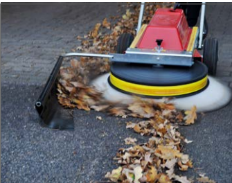
Windrow maker optionally available